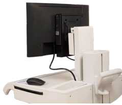
OPTIPLEX MICRO DUAL VESA MOUNT

This mount allows the Micro to be VESA mounted to select Dell E Series displays.