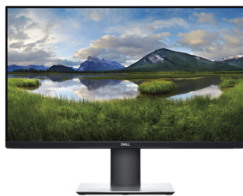
DELL 24 MONITOR - P2419H

23.8" ultrathin bezel optimized for dual display productivity. Easy Arrange feature enables multitasking efficiency and its small base frees valuable workspace.