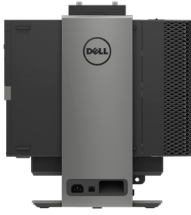
OPTIPLEX SMALL FORM FACTOR ALL-IN-ONE STAND

Small footprint mounting solution featuring integrated monitor power and Ethernet cables, as well as monitor adjustability with height, tilt, swivel and pivot functions.