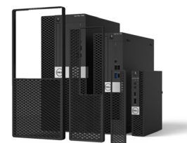
OPTIPLEX DUST FILTERS

Thermally tested custom cable covers offer an easy to install and attractive way to manage cables and secure ports.