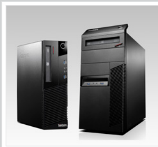
Small Form Factor Pro Expandability and functionality of a mini-Tower at just 50% of the size