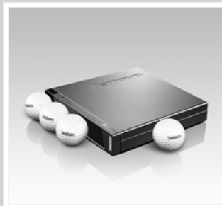
Tiny Form Factor Tiny is as compact as golf ball