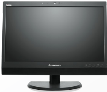
ThinkVision® LT2323z Monitor