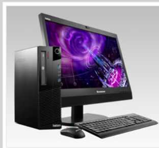
Graphic Experience life-like video quality with discrete graphics up to NVIDIA® Quadro® 410 4