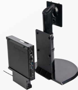
ThinkCentre® Tiny L-Bracket Mounting Kit (0B47373)