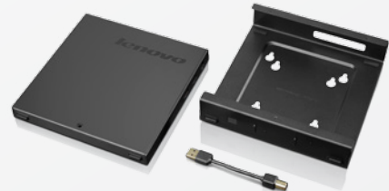
ThinkCentre Tiny Storage Unit (0B47375) ThinkCentre Tiny VESA Mount (0B47374)