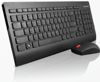
Lenovo® Ultraslim Wireless Keyboard and Mouse Combo (0A340xx)