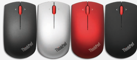
ThinkPad Precision Wireless Mouse - Midnight Black 0B47163, Heatwave Red 0B47165, Frost Silver 0B47167, Graphite Black 0B47168, Midnight Black 0B47153