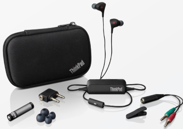
ThinkPad® Noise Cancelling Earbuds (0B47313)