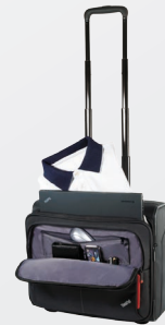
ThinkPad Radiant Roller - PN 78Y2375