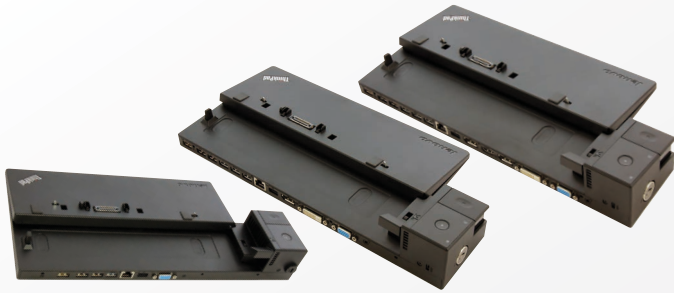
ThinkPad® Ultra Dock(40A20090XX), ThinkPad® Pro Dock (40A10065XX), ThinkPad® Dock (40A00065xx)