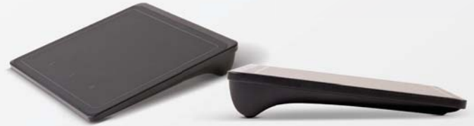
Lenovo® Wireless TouchPad (for non-touch models)