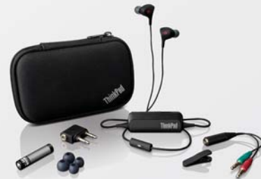
ThinkPad Noise-Cancelling Earbuds