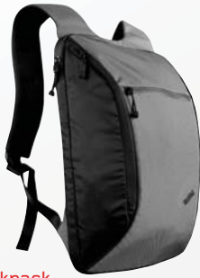
ThinkPad® Ultralight Backpack