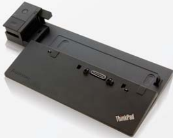
New ThinkPad docking for security, connection, and power