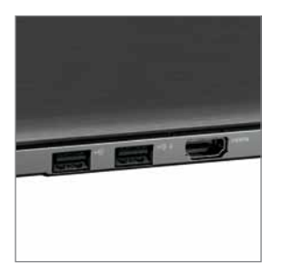
Full-size HDMI and USB 3.0 Port

The Portégé Z930 is the ultra thin Ultrabook™*** from Toshiba. Remarkably thin and light, you'll always find room in your bag for the new 33.8cm (13.3") Z930. But don't let its size fool you. With a full set of ports, magnesium alloy build, and up to 8 hours battery life*, it's one heavyweight performer.