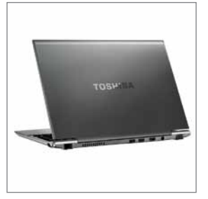
Sleek and durable casing