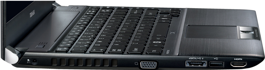
POWER VGA PORT ESATA / USB 2.0 COMBO PORT HDMI PORT USB 2.0 PORT