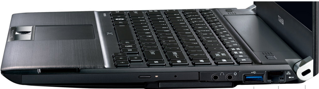
SD CARD READER DVD SUPER MULTI DRIVE EXPRESSCARD OR SMARTCARD HEADPHONE & MICROPHONE JACK USB 3.0 PORT RJ45 ETHERNET KENSINGTON™ LOCK